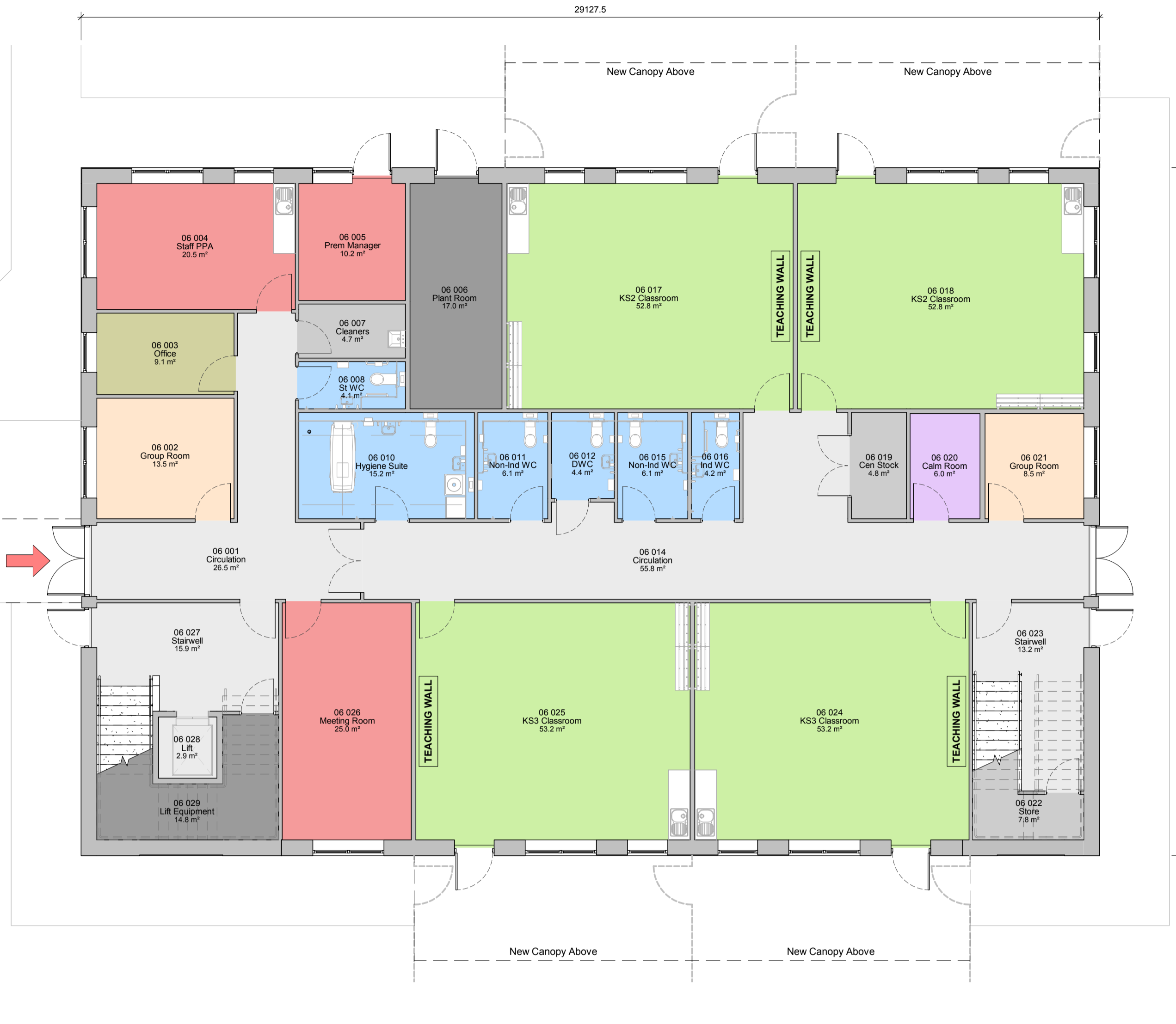
P60 General Arrangement - Block 06 - Proposed Ground Floor Scale @ 1:100

FOR FURTHER DETAIL REFER TO DRAWING 31791-DBS-01-00-DR-A-1211 BLOCK 01