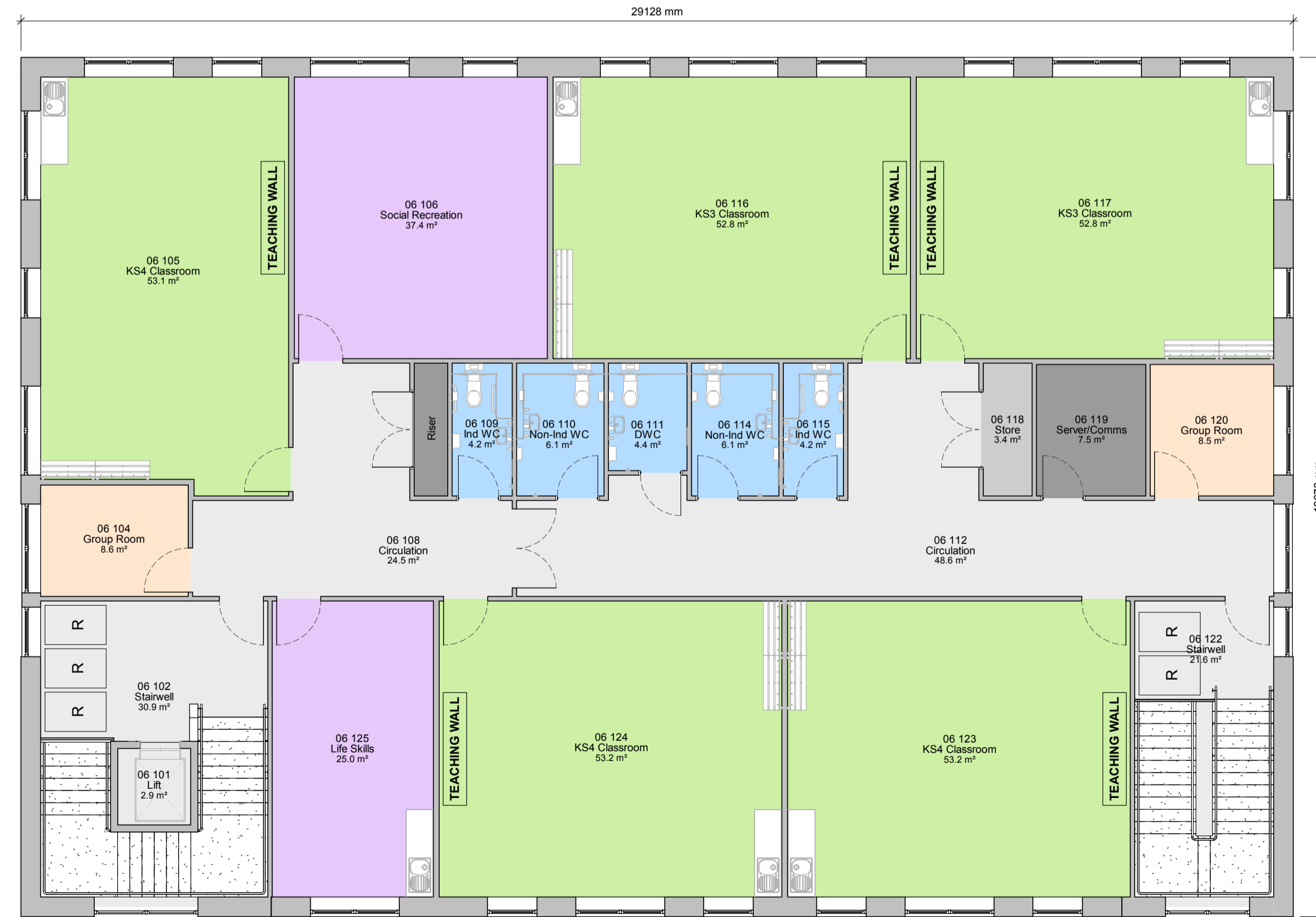
P61 General Arrangement - Block 06 - Proposed First Floor Scale @ 1:100